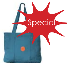
Yoga Bag UP $90, Special $79