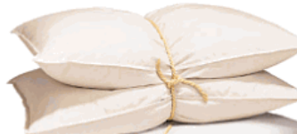
Buckwheat Pillows Large: .....$70 Medium: .....$60 Child: .....$18