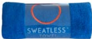
YogiToes Sweatless Towels $20