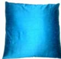
Meditation Cushion $45